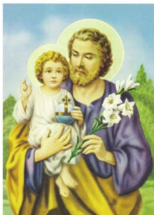
Happy Feast of Saint Joseph!